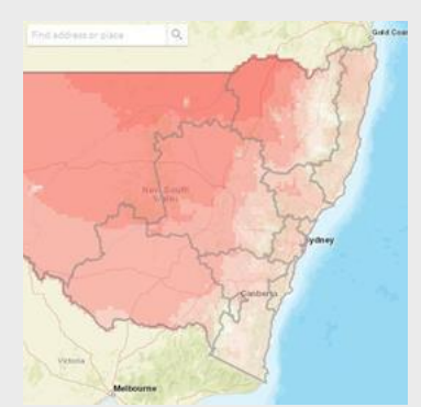
climate projections of your area Cool Playground video